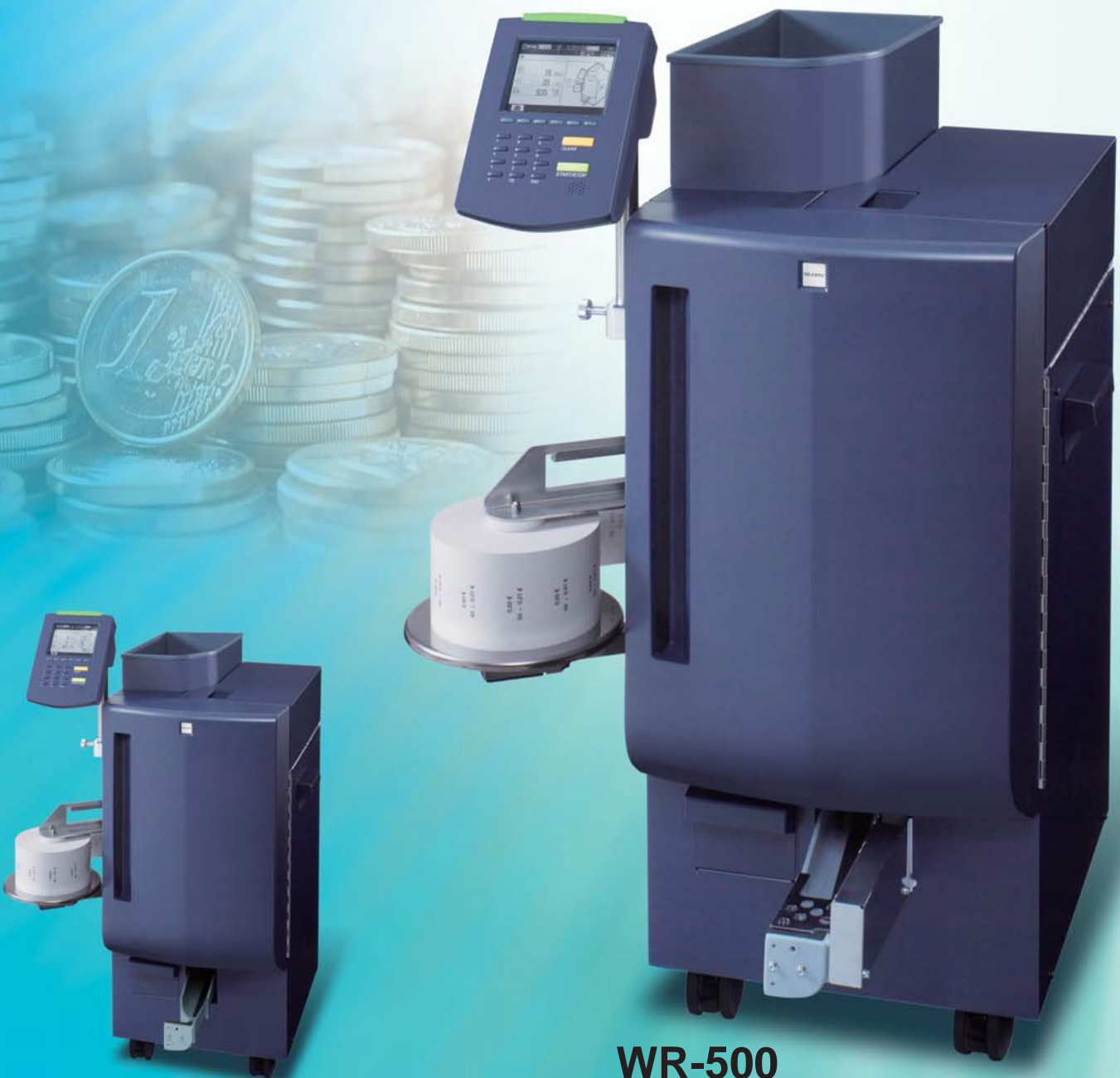
WR-90 Standard model