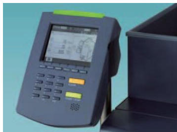
▲ Built-on LCD control panel

With utilization of built-on LCD control panel, screen visibility and operability were improved dramatically. The processing mode and data contents may be checked quickly and easily. Furthermore, easy-to-understand illustrated operation guide provides accurate and applicable support.