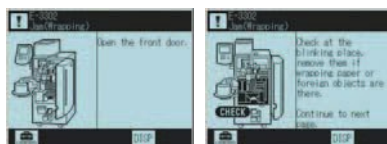
▲ Illustrated operation guidance display